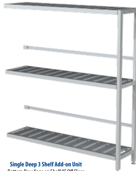
Single Deep 3 Shelf Add-on Unit Bottom Row Kegs on Shelf 8" Off Floor

Single Deep Keg Racks Designed for storing ½ size barrel kegs with 17" deep top shelf for added storage