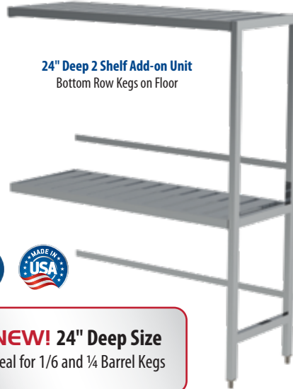
24" Deep 2 Shelf Add-on Unit Bottom Row Kegs on Floor