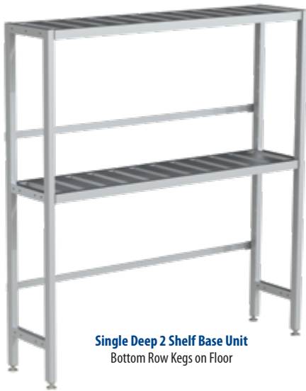
Single Deep 2 Shelf Base Unit Bottom Row Kegs on Floor