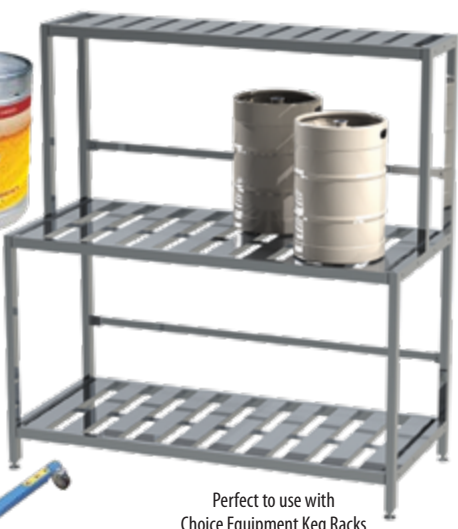
Perfect to use with Choice Equipment Keg Racks