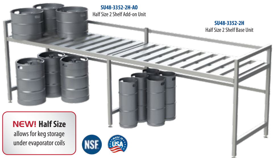
SU48-3352-2H-A0 Half Size 2 Shelf Add-on Unit