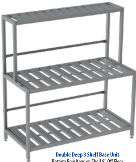
Double Deep 3 Shelf Base Unit Bottom Row Kegs on Shelf 8" Off Floor