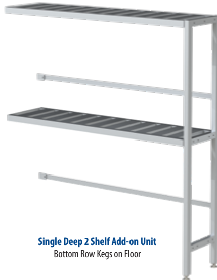
Single Deep 2 Shelf Add-on Unit Bottom Row Kegs on Floor