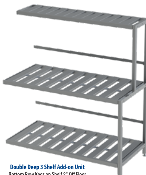
Double Deep 3 Shelf Add-on Unit Bottom Row Kegs on Shelf 8" Off Floor

Double Deep Keg Racks Designed for storing 1/2 size barrel kegs with 17" or 24" deep top shelf for added storage