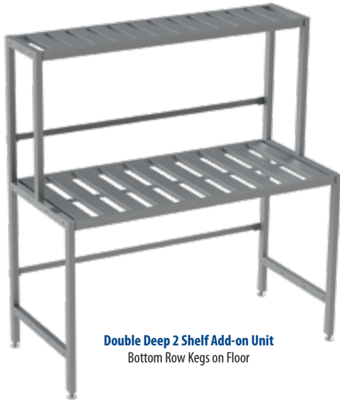
Double Deep 2 Shelf Add-on Unit Bottom Row Kegs on Floor