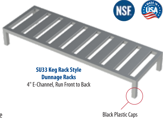
SU33 Keg Rack Style Dunnage Racks 4" E-Channel, Run Front to Back

NEW! KEG RACK STYLE Features Front-to-Back 4" E-Channels designed to hold the extra weight of Kegs