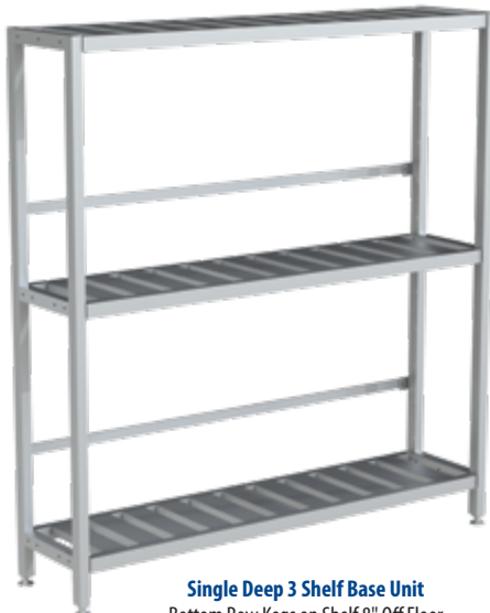
Single Deep 3 Shelf Base Unit Bottom Row Kegs on Shelf 8" Off Floor