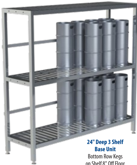
24" Deep 3 Shelf Base Unit Bottom Row Kegs on Shelf 8" Off Floor