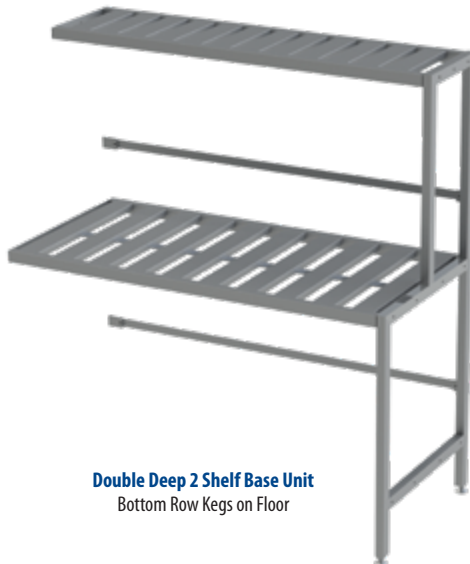
Double Deep 2 Shelf Base Unit Bottom Row Kegs on Floor